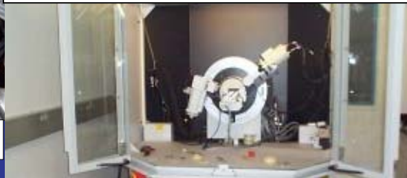
X-ray Diffraction Spectrometer