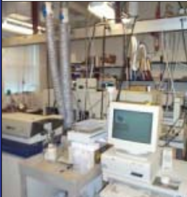
Inductively Coupled Plasma-Mass Spectrometer