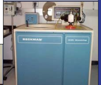
Unsaturated Flow Apparatus