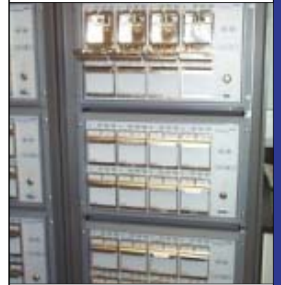
Oxford/Canberra Oasis Alpha Spectrometer

This year's cover photograph features a CEMRC radiochemist performing a step in the separation of radionuclides from environmental samples. Such radiochemical manipulations may include coprecipitation, ion exchange or extraction chromatography. Prior to the start of the separation procedure, each sample is spiked with appropriate carriers and yield tracers to assist in the quantification of the radionuclides of interest. Following separation each radionuclide fraction is converted to an appropriate form for counting by gamma spectrometry, gas proportional counting, liquid scintillation counting or alpha spectrometry. The Foreword shows various equipment used by scientists at CEMRC.