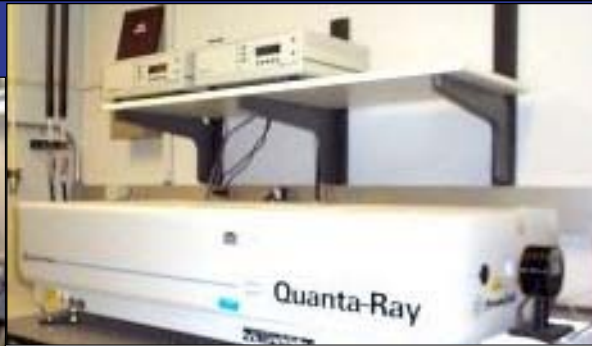
Nd:YAG Laser coupled with a MOPO