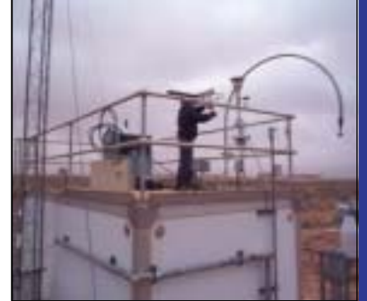
Dichotomous air sampler near WIPP Site