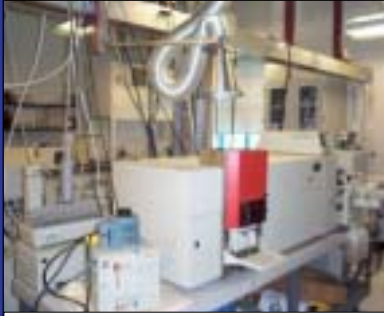
Atomic Absorption Spectrometer